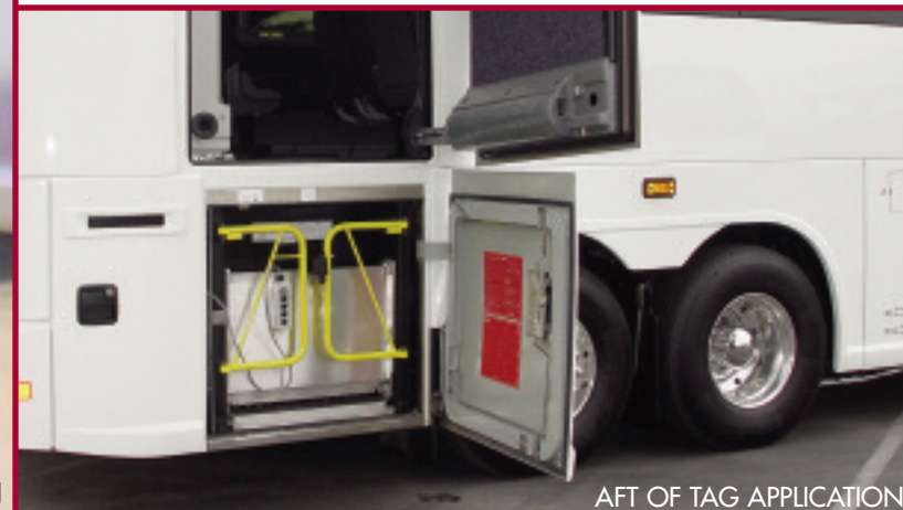
AFT OF TAG APPLICATION

Ricon also provides supplemental field support in high-demand areas through its association with its factory-trained and -certified service organizations. And we help keep things rolling by ensuring quick and accurate deliveries from our dedicated spare parts warehouse.