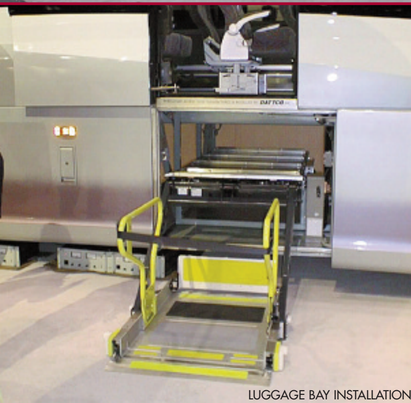
LUGGAGE BAY INSTALLATION